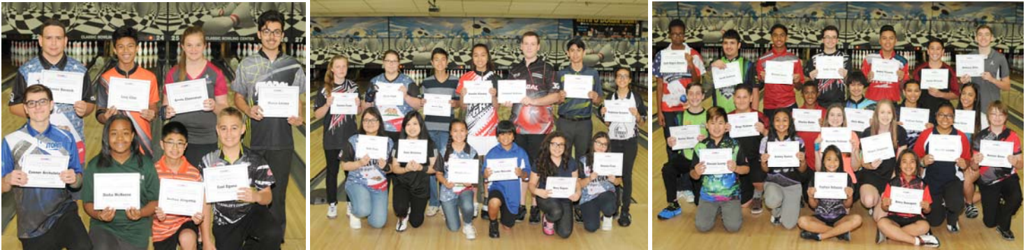
District Finals First Place Finishers - $50 Scholarship Winners

earned the FREE berths into the USBC Junior Gold Finals in Cleveland, OH this July. Each of our six champions will receive a travel stipend up to $400 for the Gold Finals along with their state scholarship and a custom embroidered jacket. All scholarship recipients will receive a scholarship packet and all funds will be held with USBC SMART. We will be distributing the scholarship packets at the California USBC Convention in Visalia on June 10-11 and will mail the remaining packets directly to each bowler. Full tournament results and scholarship breakdowns can be downloaded online at CalUSBC.com .